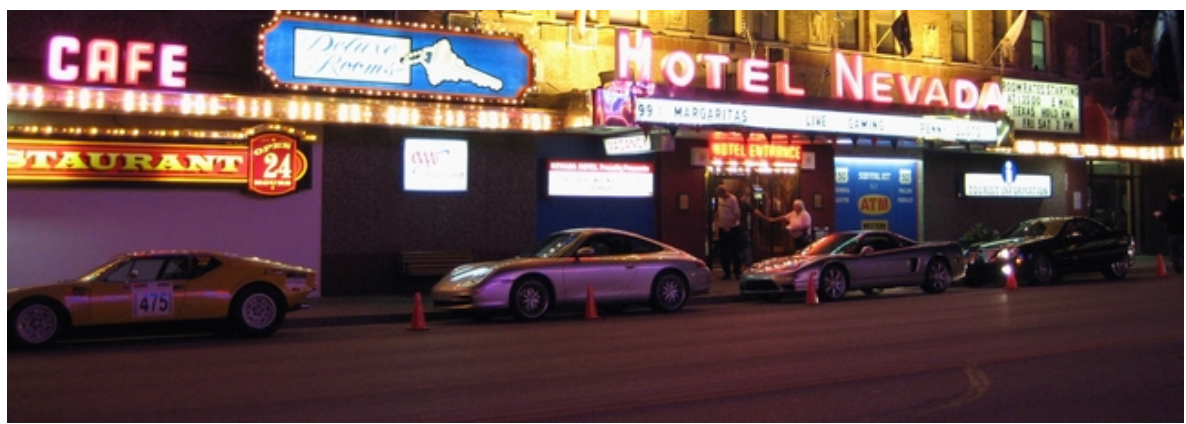
Front Row Parking at Hotel Nevada reserved for SSC entrants: Pantera, Porsche, NSX, SL55

After a night in Vegas we caravanned to Ely Nevada with a bunch of other speed freaks and gear heads. The trip included a reconnoitering drive the "wrong way" up the 90-mile stretch of 318 where the event was to be held. Frankly, I was stunned by the spectacular scenery and excellent road conditions. Beautiful high-desert landscapes combined with long straights and high speed turns running between two picture postcard mountain ranges. The course also includes a tight section of river gorge turns known as "The Narrows" that commands respect and admiration. If this isn't one of the tracks available on Grand Tourismo 3 or Grand Theft Auto, then the gaming geeks have overlooked a great opportunity.