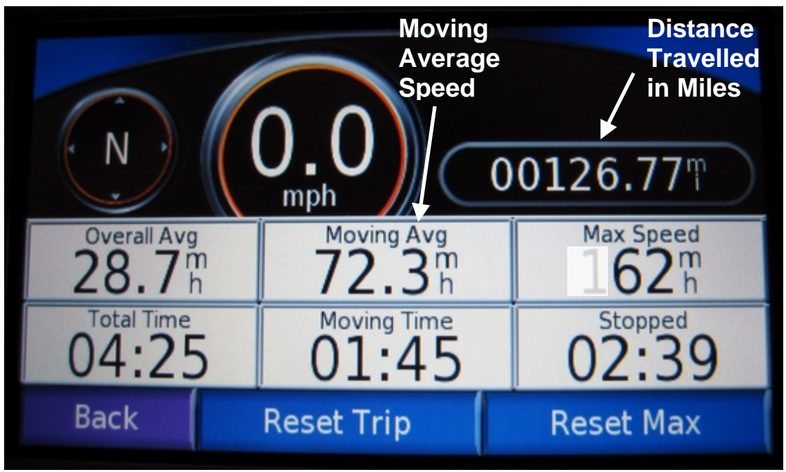
The Garmin Nav was essential equipment (for me) because the indicated speed, odometer and trip computer on my car contain a disparity too large for this event. The Nav's "Moving Time" was unreliable by approx ½ second each time the car stopped and started. OK for an event that includes a start and a stop but not accurate enough for standing start and a moving finish. If you have a Garmin just touch the time displayed on your home screen (bottom left) to reach the display format shown here.

<u>The Plan</u>: It wasn't too tough to prepare a list of time vs. distance (virtual) checkpoints based upon speeds to run for each section. The plan I ran had 4 sections run at different speeds and the frequency of check points steadily increased as the mileage to the finish decreased, so that repeated "fine tuning" could be accomplished near the end of the run. Furthermore, by aiming to hit marks beginning at 10 miles into the run, the amount of adjustment required near the end should be minimal. It's worth considering when making your plan that it gets harder and harder to adjust average speed the farther into the run you travel and that any speed change you make cannot be instantaneous.