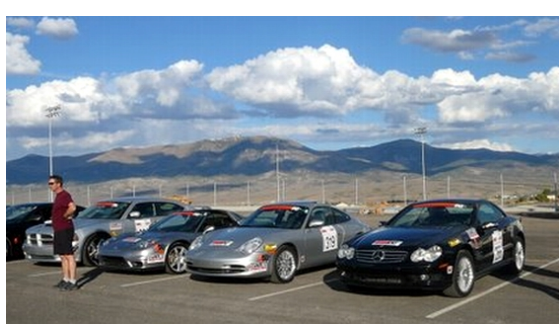
Staging before the Parade