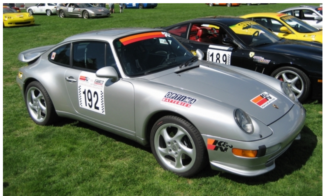
Philip Bowser's beautifully prepared 993 C2 Turbo, ready to run in the 150mph group. Phil and his navigator/daughter Amy crossed the finish line only 0.4370 seconds off target after driving 90 miles, which calcs out to an average speed of 149.9697mph – nice!

On Sunday morning we had to be in our cars at the staging area in Ely by 6:00am ready to drive together to the truck stop pre-event staging area. The early start was not much of a problem for those of us who'd had the "night before finals" kind of sleep. Fortunately, the Starbucks inside the Hotel Nevada was open and life was good. I guess we weren't the only people sleeping light because arriving at 5:45am put us near the back of the line.