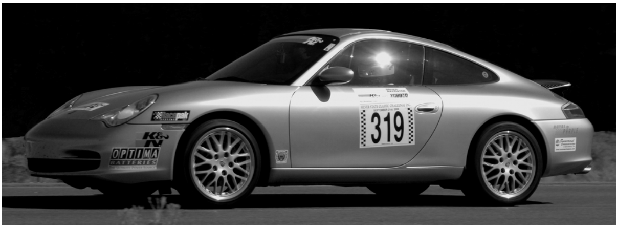
Gerry McFaull, 2002 C2, 21 September 2008, The Narrows, Highway 318, Nevada.

At 70.2 miles distance there's an off-camber right turn that is popularly referred to as the "most treacherous blind turn on the course". With the theme from Jaws running through my mind and the wick turned down to 90 the Porsche took a set and tracked effortlessly through the corner following the classic line. The Jaws music turned to Satriani and for the next 2 miles we practiced carving text book turns between the rock walls of the Narrows – entry point, ...apex, ...exit point, ...sweet. Even at a relatively modest 90mph this was high octane F-U-N. Just check out my smile in this classic-style black & white picture – those teeth whitening strips really work!