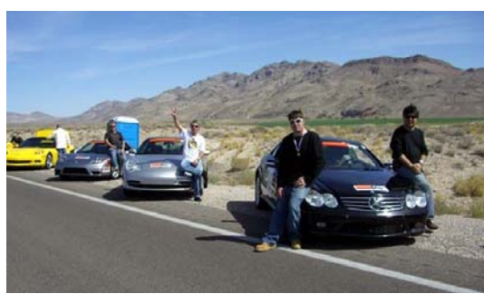
Post race - rookies no more!